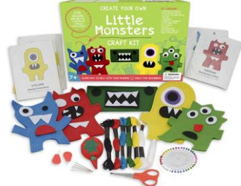
Over 100 Pieces Included in Each Kit

I wrote up a funding request and they have fully supported this project by covering the finances needed to purchase the monster kits! I am extremely grateful, and the seniors are looking forward to this experience!